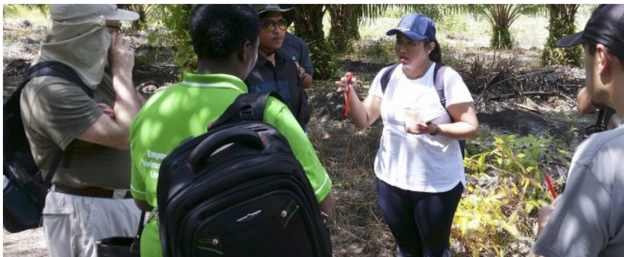
Field visit in palm oil plantation with RSPO certified producers

It is expected that the results of this research will be presented during important upcoming international forums on climate change. The objective is to generate reports in 42 jurisdictions and 38 states, to provide feedback to governments on improvements in their LED-R strategies, understand the challenges and opportunities related to them and identify which elements need specific support in some jurisdiction, in order to provide information to potential investors or donors and measure the risk they could assume by investing in these jurisdictions.