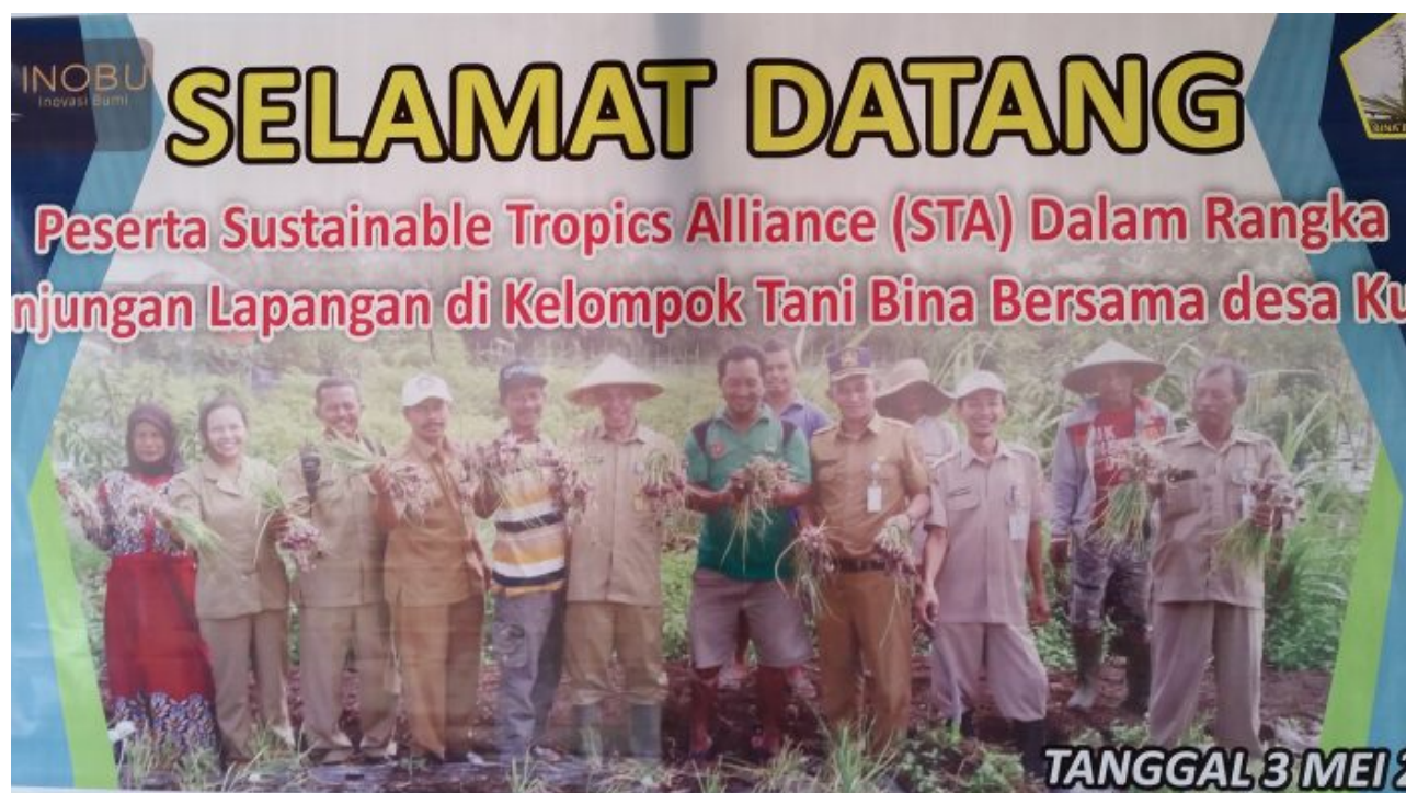
Field visit to indigenous community Desa Kubu of AMAN organization

It is expected that the results of this research will be presented during important upcoming international forums on climate change. The objective is to generate reports in 42 jurisdictions and 38 states, to provide feedback to governments on improvements in their LED-R strategies, understand the challenges and opportunities related to them and identify which elements need specific support in some jurisdiction, in order to provide information to potential investors or donors and measure the risk they could assume by investing in these jurisdictions.