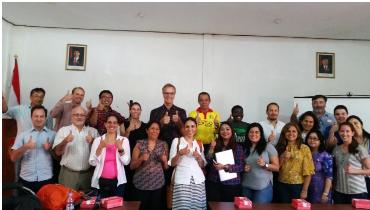
STA meeting with the Kotawaringin Bara District Chief